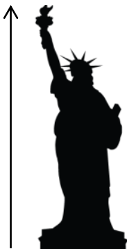
Statue of Liberty 6 times