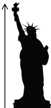
Statue of Liberty 8 times