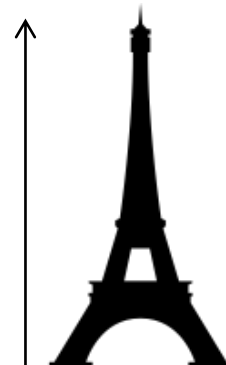
Eiffel Tower 1 time