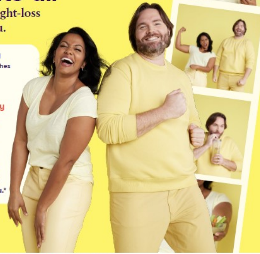
Get started today at wondrhealth.com

and be your healthlest self— while eating the foods you love. Our program is based on behavioral science and takes a personalized approach that fits into your life—at no cost to you.*